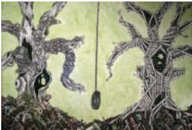
21 Roscoe Wilson, (Fairfield, Ohio), Playground , graphite and oil on paper, 18" x 28" x 7", 2005