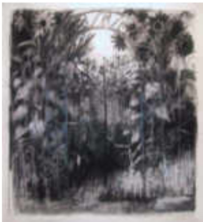
11 Jennifer Rosengarten, (Yellow Springs, Ohio), Trellis 2 , charcoal, oil pastel, pastel, graphite on paper, 72" x 50", 2004