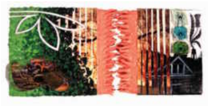
15 Derek Toebbe, (Newport, Kentucky), Darwin Was Wrong , mixed media, 6" x 14", 2005