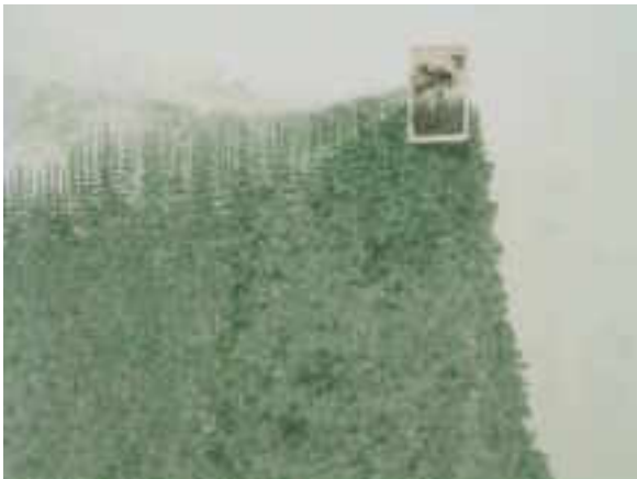
Andrea Moreau, (Columbus, Ohio), Poland (Evergreen forest) , colored pencil and postage stamp on paper and wall, (detail), 2005