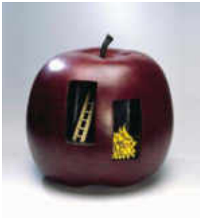
Susan Clusener, (Bloomington, Indiana), Apple Cellar , ceramic, 21" x 20" x 22", 2004