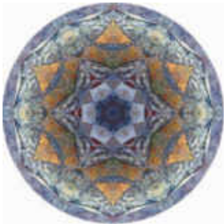
Allison Trentelman, (Belfast, Maine), Mandala 194 , archival inkjet pigment print, 12" x 12", 2004