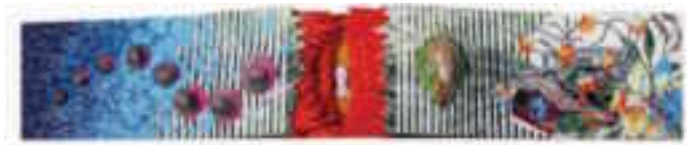
Derek Toebbe, (Newport, Kentucky), The Space Between , mixed media, 11" x 40", 2005