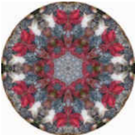
17 Allison Trentelman, (Belfast, Maine), Mandala 246 , archival inkjet pigment print, 12" x 12", 2004