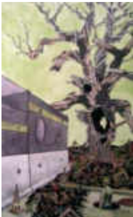
Roscoe Wilson, (Fairfield, Ohio), Man in a Hole , graphite and oil on paper, 29" x 19" x 7", 2005