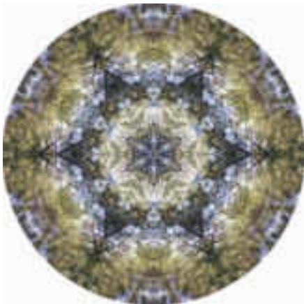
Allison Trentelman, (Belfast, Maine), Mandala 369 , archival inkjet pigment print, 12" x 12", 2004