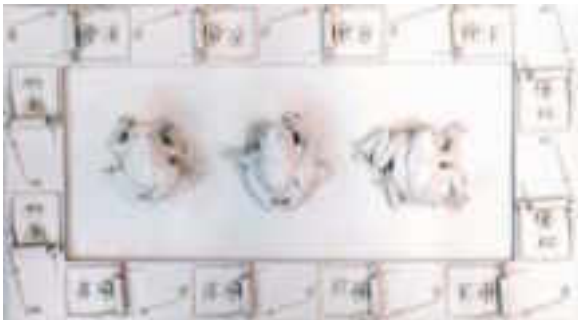
Susan Kirby, (Middle Village, New York), White Rats , acrylic, plastic, traps on wood, 10" x 17.5" x 2", 2003