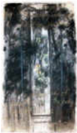
Jennifer Rosengarten, (Yellow Springs, Ohio), Before Gardens, After Gardens , charcoal, pastel, graphite on paper, 84" x 50", 2005