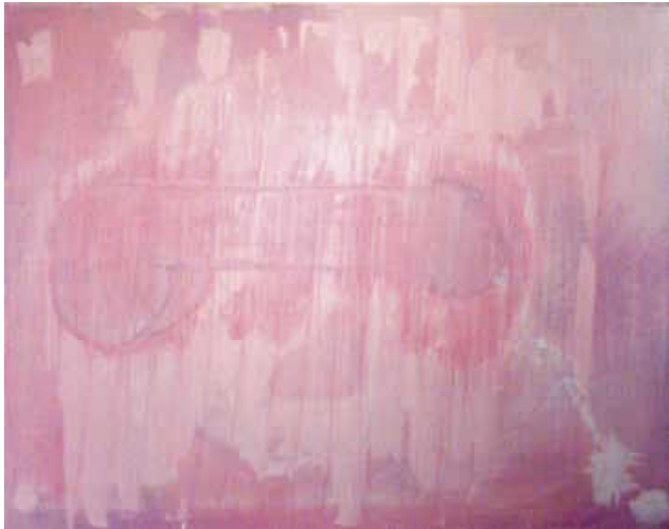
Pretty in Pink , acrylic on canvas, 22" x 28", 2005