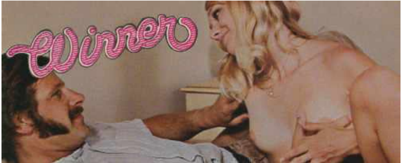
Winner, photo collage, 14" x 34", 2004