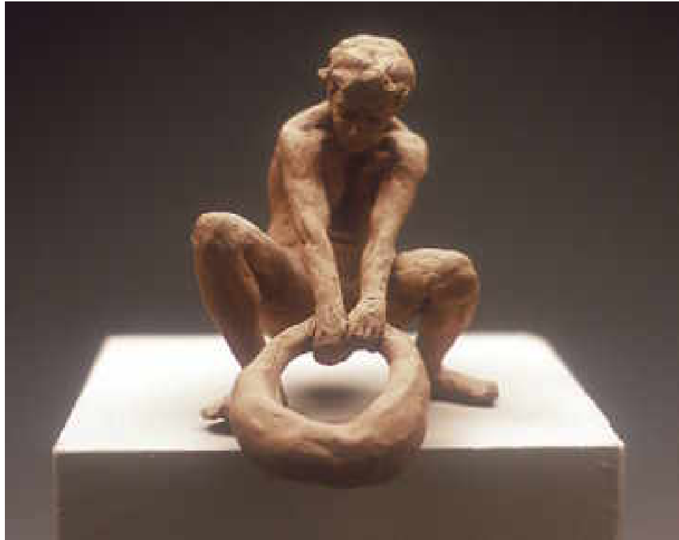
15 Pulling My Weight , ceramic, 4". 2005 (Second Place)