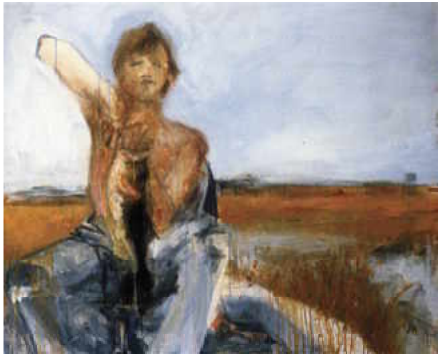
Bill with Fish , oil and encaustic on canvas, 50" x 34", 2004 (Best of Show)

"Pink with Green Belly" demonstrates an intuitive approach to painting that emphasizes form, gesture and color. The disposition applied in this piece, for example; white/ black, pink/ green, flat/ textural, and geometrical/ organic cooperatively imply a feminine/masculine duality.