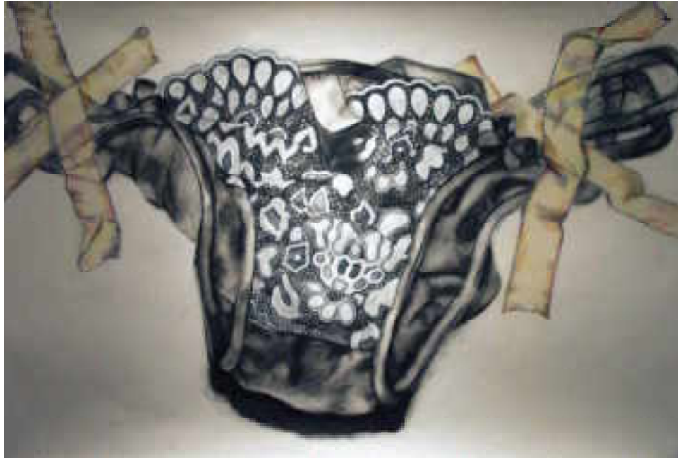
Taped VI , charcoal on paper, 50" x 38", 2005