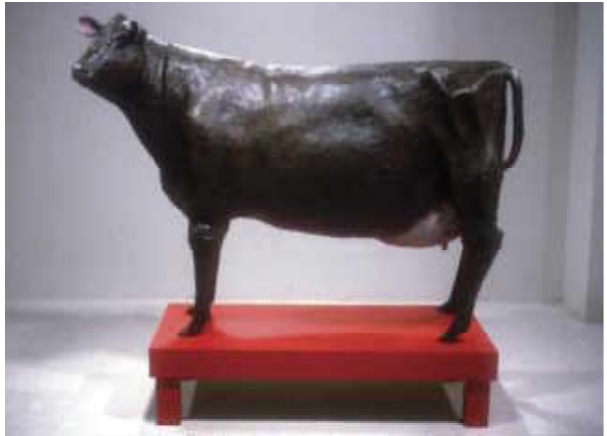
Learning to make the Perfect Human , mixed media, 60" x 72" x 36", 2005

"The Perfect Human" is a series of sculptural/installation pieces I've been working on since last spring. "Learning to make the Perfect Human" was the sculptural project I used to work out the odds and ends of how I was going to get started making "The Perfect Human." It's partially a process piece (me learning to weld and carve Styrofoam a little better) and it's also partially a symbolic beginning for the larger series that I am now in the midst of. The production of milk is a very basic biological function of motherhood. This piece is the progenitor of every piece in the series I'm currently working in. It made sense to me to use a female cow, an icon of milk production, for the initial step toward the completion of my current cycle of work.