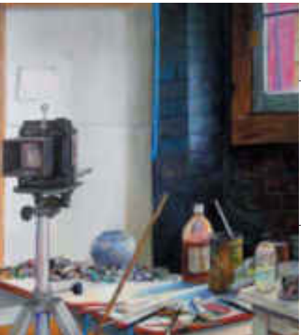
BIG 2006 oil on wood 53" x 48"