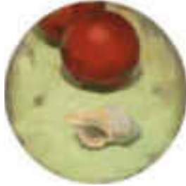
SEASHELL AND LEMON TONDO SEASHELL AND PLUMS TONDO